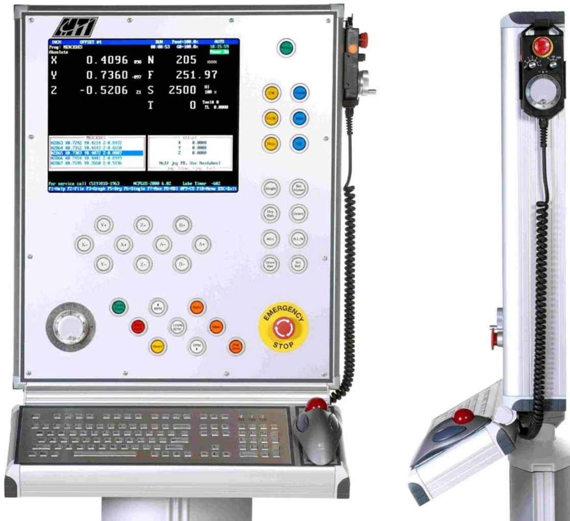
Front and side views of the revolutionary MTI Constant Velocity Controller.

(In over-molding, segments of seismic cable and soldered connectors are fed into the mold tooling and a tough plastic shield is applied against moisture, dirt, shock, strain and stress.)